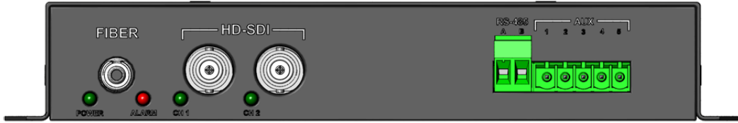
Figure 2-1-1 F-M2SDI-Tx Front Panel