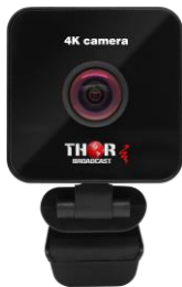
ePTZ Camera x 1