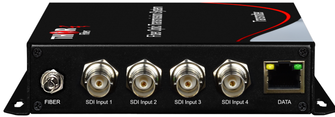
Transmitter - original product image

Portable 4-channel 3G-SDI and bi-directional Gigabit Ethernet transmitter/receiver kit over one single-mode fiber.