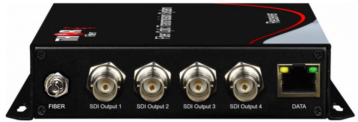
Receiver - original product image