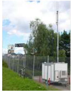
A base transceiver station (BTS)