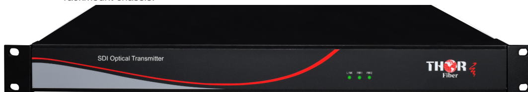
Front panel - original product image

2-channel SD/HD/3G-SDI CWDM transmitter / receiver kit in a 1RU 19 in. rackmount chassis.