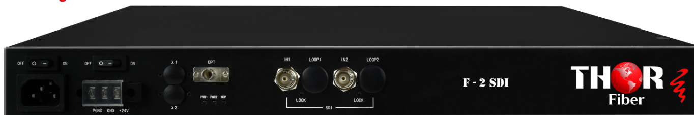
Rear panel / chassis image - original product image