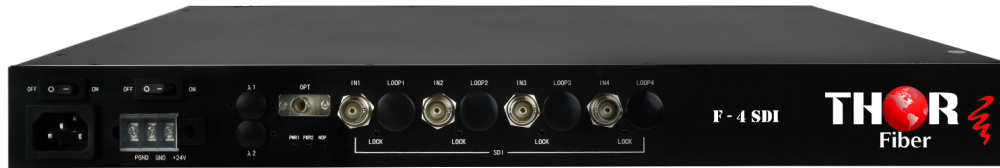
Rear panel / chassis image - original product image