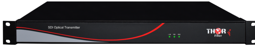
Front panel - original product image

4-channel SD/HD/3G-SDI CWDM transmitter / receiver kit in a 1RU 19 in. rackmount chassis.